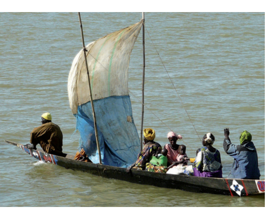
Figure 2. Niger, Mopti, Mali.

In clashing contrast with this scenery, the Niger river flows unperturbed, without realizing that without its water, all around it there would not even be the little that there is. Evening after evening, at sunset, it quietly goes to sleep (Figures 1-2).